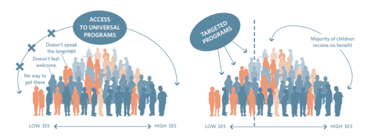
Figure 1: Universal versus targeted intervention